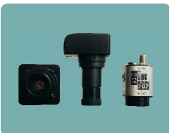
CCD and USB camera